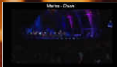
Mariza - Chuva