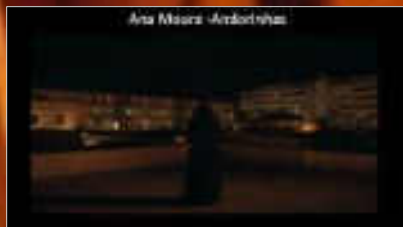
Ana Moura -Andorinhas