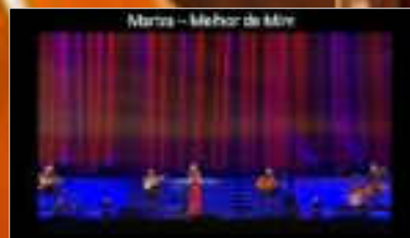
Mariza - Melhor de Mim