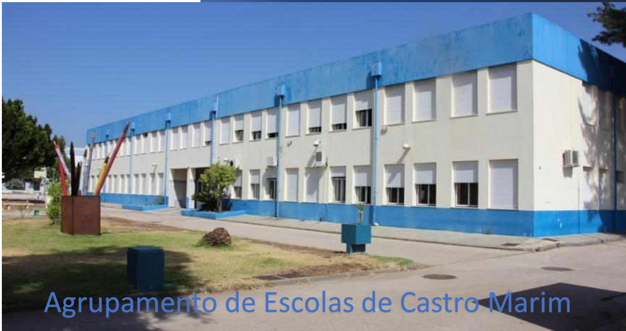
Agrupamento de Escolas de Castro Marim